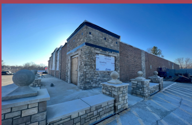
Bedford Police Department Construction Progress at 2308 16th Street

Progress on the new Bedford Police Department continues, with construction estimated to be completed on July 31, 2023. We are excited to offer a new facility, with over double the amount of square footage, allowing space for expansion, growth and regional collaboration.